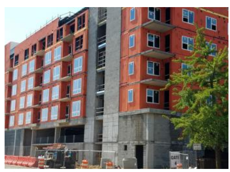
Third & Grand Luxury Apartments

I am excited and optimistic about two major adjuncts to our company. LGC Global Energy FM is a major addition to our parent company. Read more about it in this edition of the newsletter. We are also proud to have a plan in place to build an executive training center to align all of our operations, and combine the talents and strengths of the men and women who we have onboard. We have begun an intense training program for our managers to improve organizational skills. I understand that it is imperative