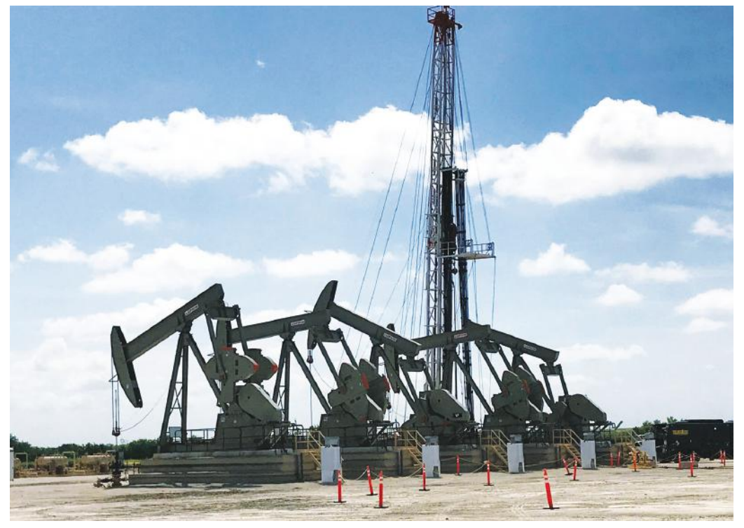
J & X Energy and J & X Trucking Co. Kenedy, Texas

Growth Includes Services to the Oil Industry