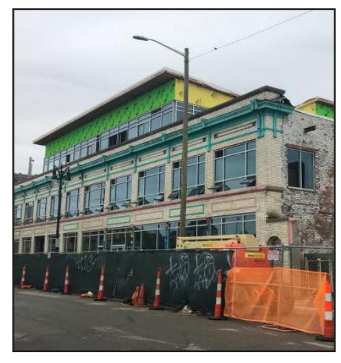
Baltimore Station Apartments

I am excited and optimistic about two major adjuncts to our company. LGC Global Energy FM is a major addition to our parent company. Read more about it in this edition of the newsletter. We are also proud to have a plan in place to build an executive training center to align all of our operations, and combine the talents and strengths of the men and women who we have onboard. We have begun an intense training program for our managers to improve organizational skills. I understand that it is imperative